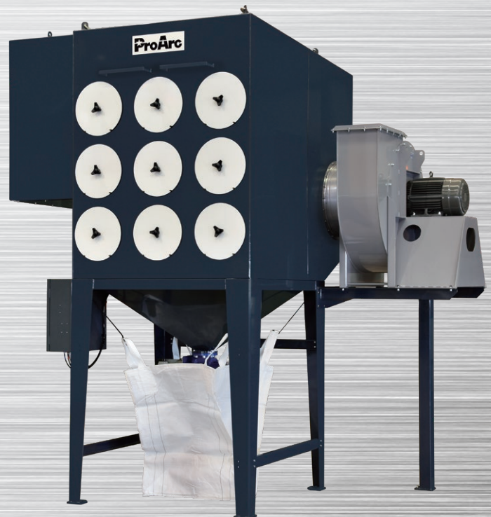
• DC 3-18