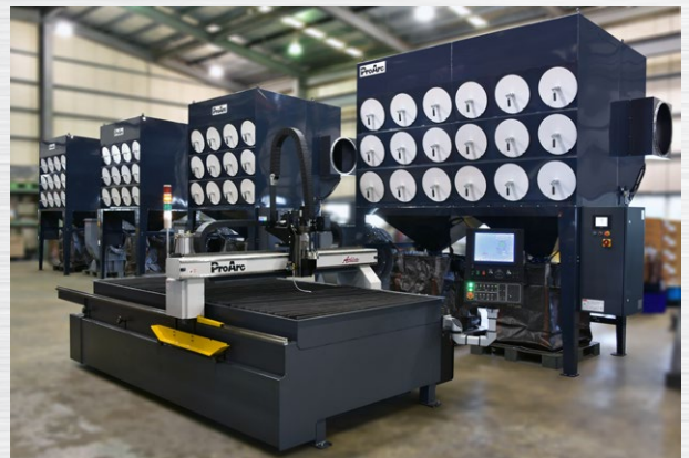
• Athlete CNC cutting machine